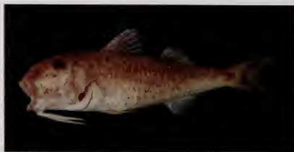
Fig. 8. Paratype of Parupeneus nansen , USNM 395047, male, 139 mm SL, Mozambique, 26°9.5'S, 32°58.5'E, 43–45 m.

in SL; head length 2.85–2.95 in SL; interorbital space flat medially; snout length 1.9–2.05 in HL; interorbital space flat medially; maxilla symmetrically rounded posteriorly; depth of maxilla 5.05–5.3 in HL; barbel length 1.35–1.45 in HL; longest dorsal spine 1.85–2.0 in HL; pectoral fins 1.35–1.4 in HL; pelvic fins 1.5–1.6 in HL; colour in alcohol pale tan, the edges of the scales a little darker; a faint orangish brown stripe following lateral line; no dark spot on eighth lateral-line scale; fins translucent pale yellowish; colour when fresh light yellowish grey dorsally, the scale edges narrowly red, grading to silvery grey below, the red edges of scales progressively fainter ventrally; head broadly red dorsally, grading to silvery white on cheek and operculum; barbels white; caudal fin with three large deep pink to red spots, one in each lobe and one at midbase of fin.